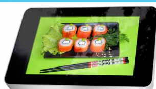
Anti Reflective Glass