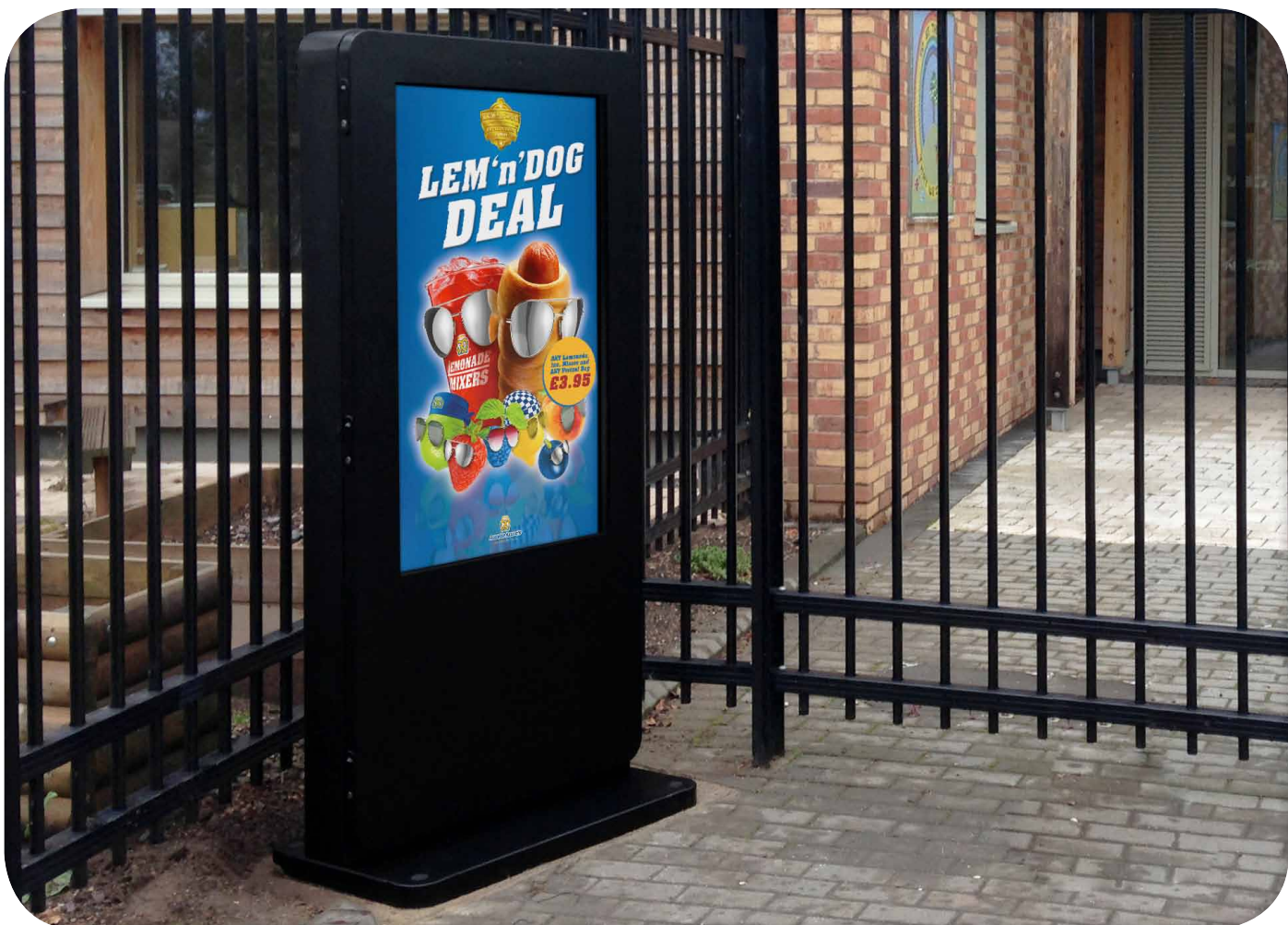
Product In Situ