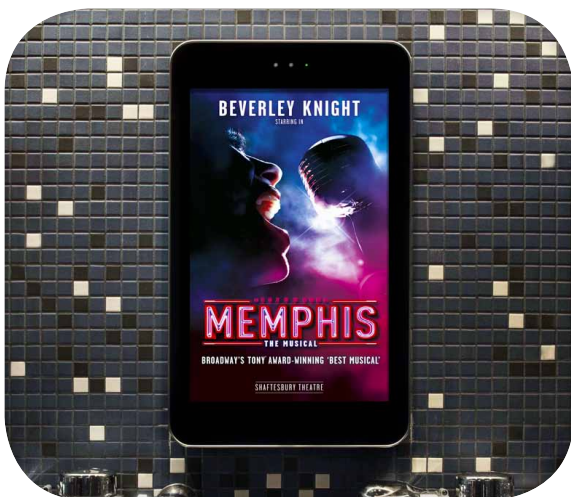
Product In Situ