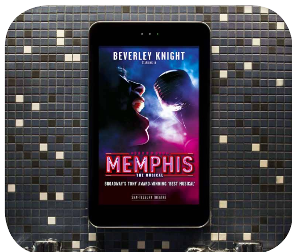
Product In Situ