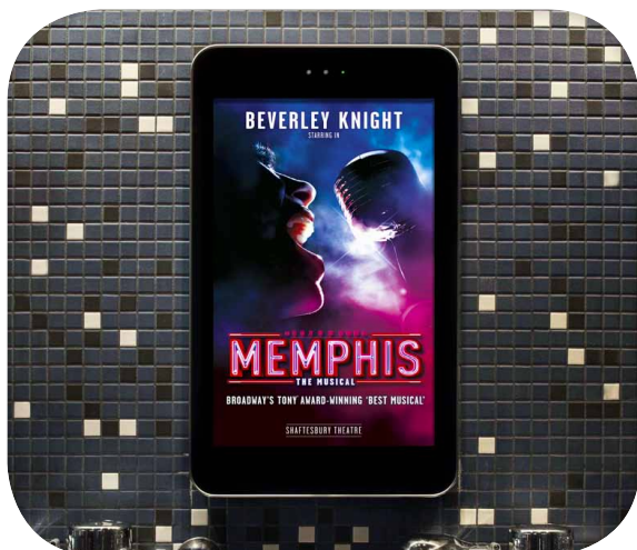
Product In Situ