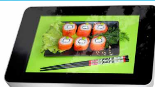
Anti Reflective Glass