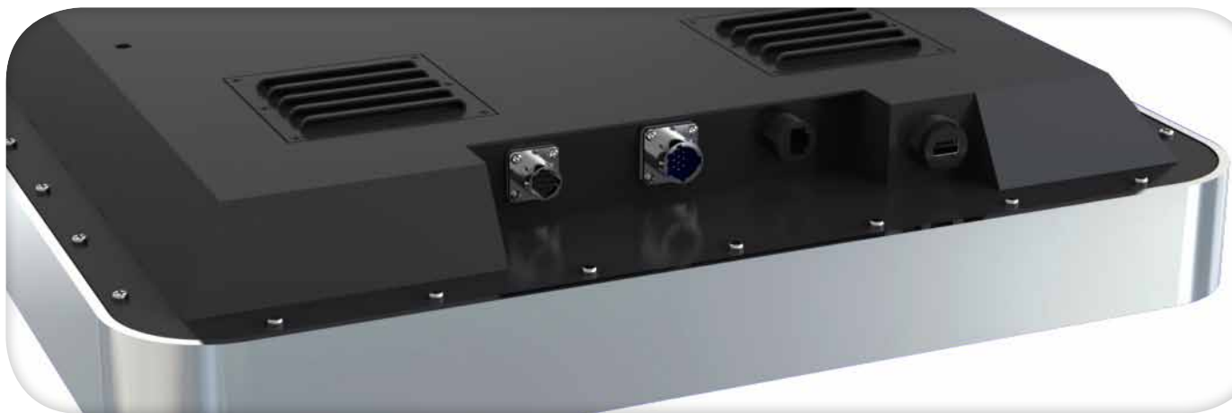
IP65 Rated Waterproof AV Inputs