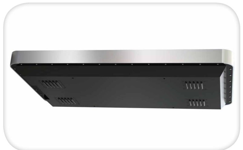
Aluminium Surround and Rear